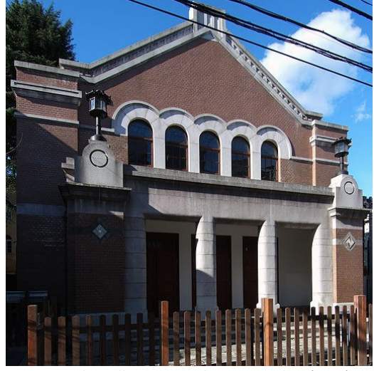
6 - Kyodo Hall, Hongo, Tokyo, December (Wiiii)

I sincerely ask you to take notice of the dates mentioned so that the IAHR International Committee can have its 2023 meeting with as many delegates from as many member associations as possible. Although planned to be a completely hybrid meeting, it will be unable to be held during hours convenient to all online participants due to time difference.