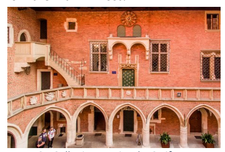
2 - Collegium Maius, by Swifteye

Let's look forward to more news from the Kraków host!