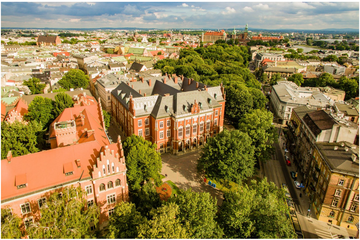
1 - Collegium Novum, Jagiellonian University